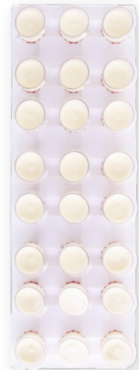
PACKAGING PREVIEW Single-flavor packs of 24 shots