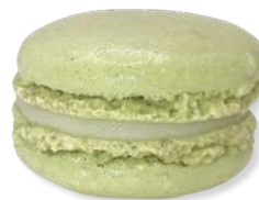
Lime with COINTREAU®