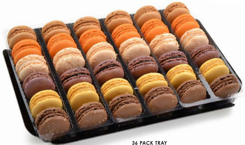
36 PACK TRAY

Our medley of Parisian macarons are made in the classic French tradition, sandwiching two petit crisp cookie shells together with a flavor-bursting filled center. The delicate light-as-air macarons come in an assortment of six flavors: salted caramel, candied orange, toasted coconut, fig poppy seed, lemon curd and chocolate hazelnut.