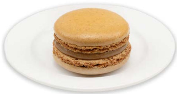
BUTTERSCOTCH MOLTEN LAVA MACARON

Imagine a crisp and soft macaron shell that encases a rich molten center. When you take bite, the crunch of the shell gives way to the luscious, flowing center creating a delightful contrast like you've never experienced before! Simply heat from frozen for up to 30 seconds (heating time may vary depending on microwave).