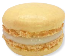
Lemon with COINTREAU®