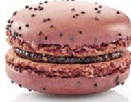
FIG POPPY SEED