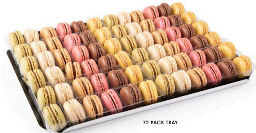
72 PACK TRAY

Brioche Pasquier is the world's largest producer of Parisian Macarons, with more than 1 million macarons made per day. For more than 20 years, we have improved our "savoir-faire" to bring you the perfect macaron, made with only natural ingredients and cage-free eggs. Our delicate, light-as-air macaron come in an assortment of 6 top-selling flavors, preserved in a unique packaging that maintains freshness and taste.