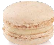
VANILLA Naturally Flavored