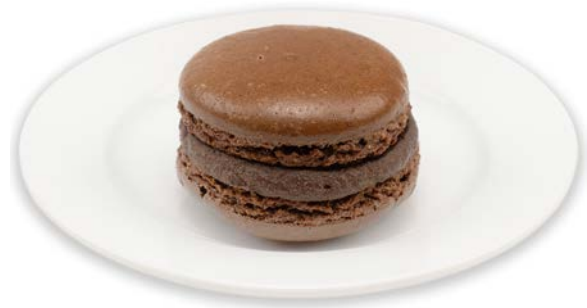
CHOCOLATE MOLTEN LAVA MACARON