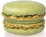
PISTACHIO Naturally Flavored